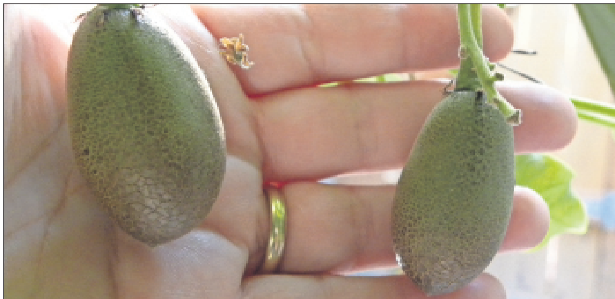
ILLEGAL: If avocados are found to be immature, the sale of this fruit will be prohibited.

Vir verdere inligting oor die volwassenheidsbepalings skakel die Subtropiese Kwekersvereniging (Subtrop) by tel: 015 307 3677.